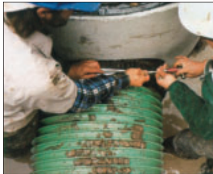
9. Tighten strap around the manhole boot.