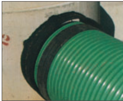
7. The pipe and gasket are ready for assembly into the manhole boot.