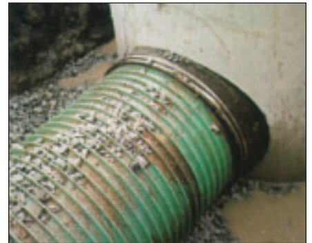
10. Completed assembly.