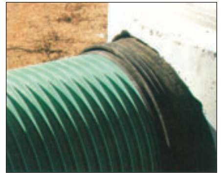
8. Position the pipe and gasket inside the manhole boot so that the gasket is under the strap location.